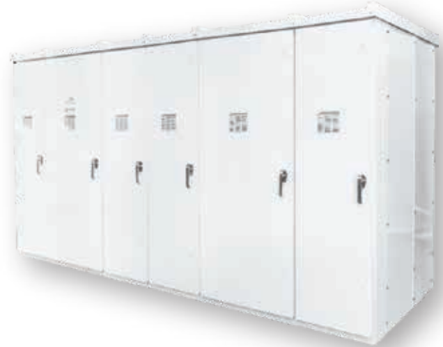
Pictured above: UL 891 / NEMA 3R, 480 / 800VAC, 6000A SWBD, single ended, with: cable input section, 5000A main, ACB feeder section, MCCB feeder section & SEL control section